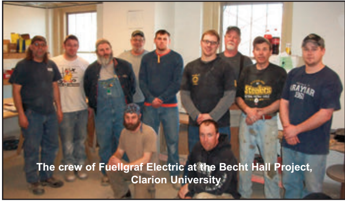
The crew of Fuellgraf Electric at the Becht Hall Project, Clarion University