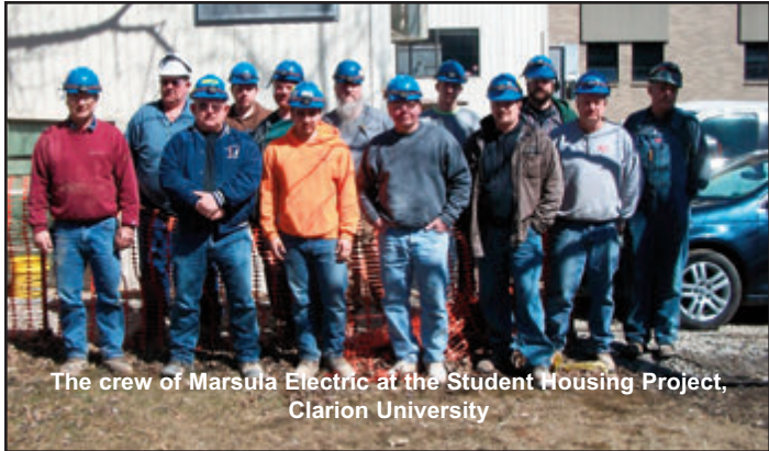
The crew of Marsula Electric at the Student Housing Project, Clarion University