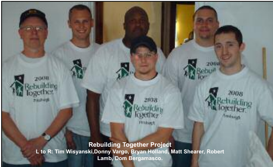
Rebuilding Together Project