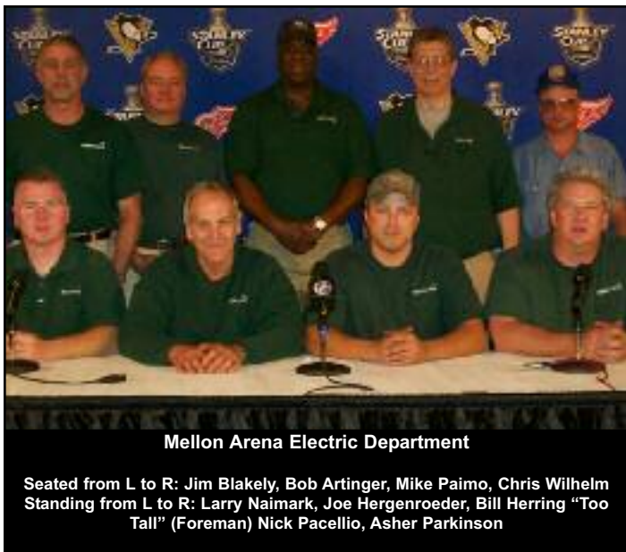
Mellon Arena Electric Department