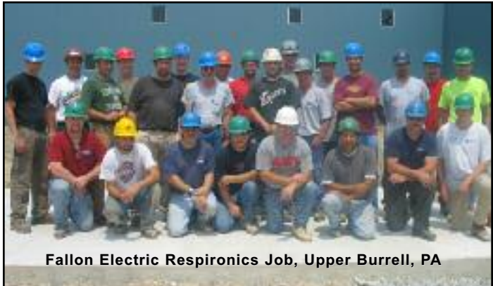
Fallon Electric Respironics Job, Upper Burrell, PA