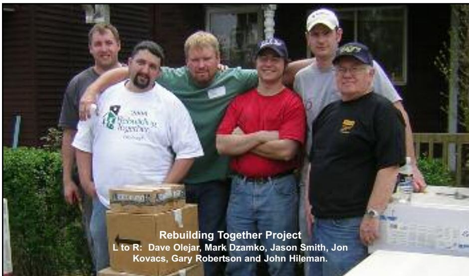
Rebuilding Together Project