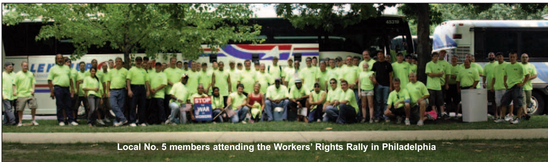
Local No. 5 members attending the Workers’ Rights Rally in Philadelphia