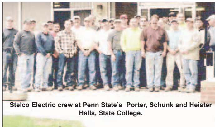
Stelco Electric crew at Penn State's Porter, Schunk and Heister Halls, State College.