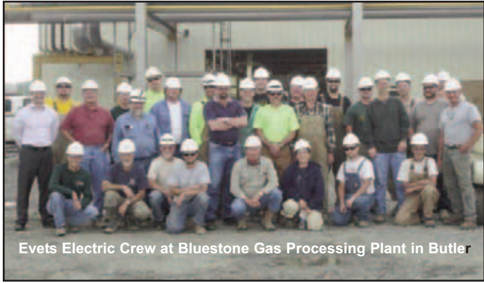
Evets Electric Crew at Bluestone Gas Processing Plant in Butler