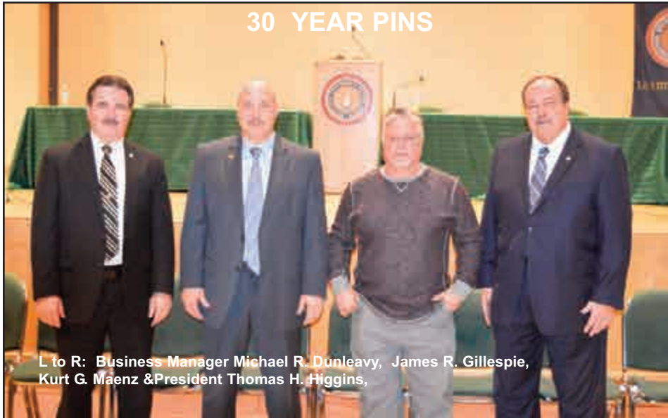
30 YEAR PINS