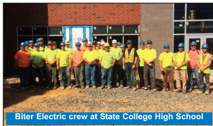
Biter Electric crew at State College High School