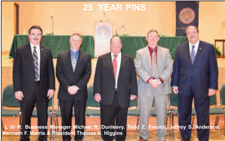
25 YEAR PINS