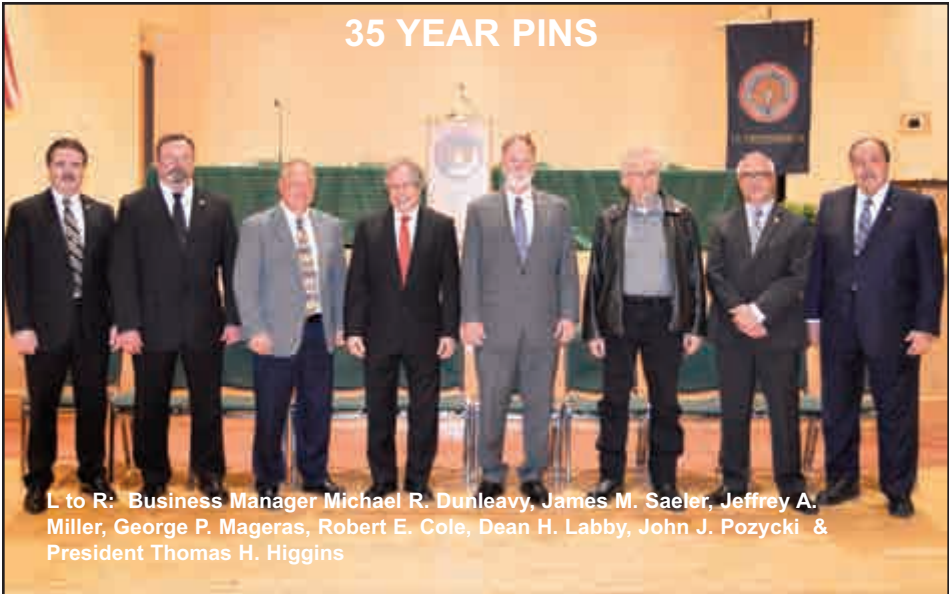
35 YEAR PINS