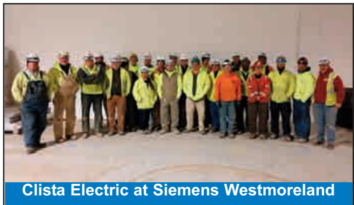
Clista Electric at Siemens Westmoreland