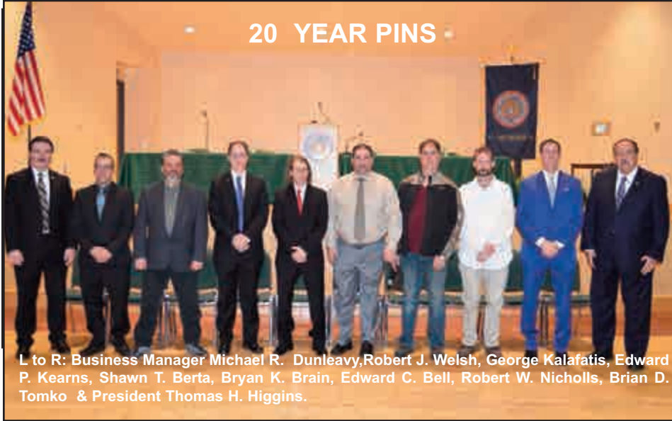
20 YEAR PINS